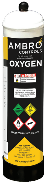
1811323 Oxygen 1L