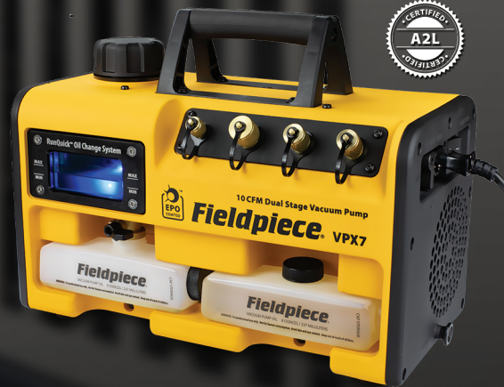
Vacuum Pumps VPX7, VP87, VP67