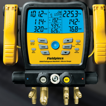
Refrigerant Manifolds SM480V, SM380V