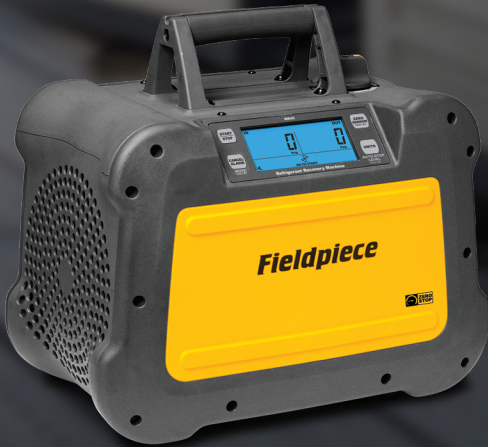
Recovery Machine MR45