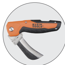
Knife shown folding into handle