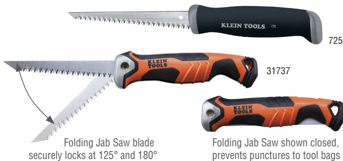
Folding Jab Saw blade securely locks at 125° and 180°