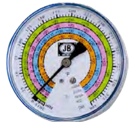
M2-400 4" Illuminating, Class 1, 1%