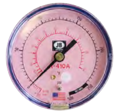
M2-810 (R410A Only) 3-1/8" Non-illuminating, Standard