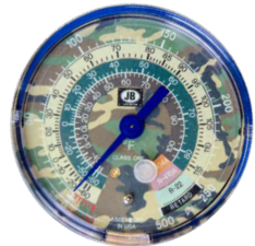
M2-924CM 3-1/8" Illuminating, Class 1, 1%