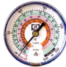
M2-820 3-1/8" Illuminating, Standard