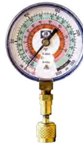
QC-G430 2-1/2" Single Test, Standard