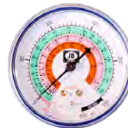
M2-460 2-1/2" Non-illuminating, Standard