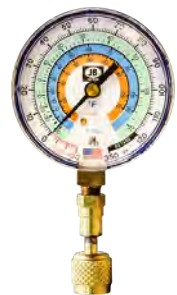
QC-G851 3-1/8" Single Test, Standard