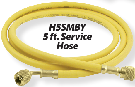
H5SMBY 5 ft. Service Hose