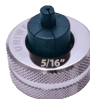
UEH-516 (Sold Separately)