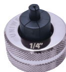
UEH-14 (Sold Separately)