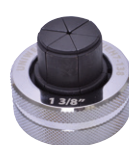
UEH-138 (Sold Separately)