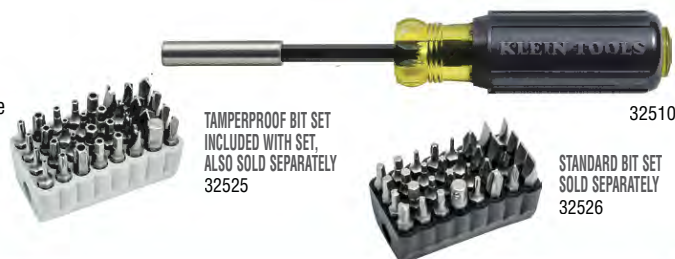
TAMPERPROOF BIT SET INCLUDED WITH SET, ALSO SOLD SEPARATELY 32525

TORX® is a registered trademark of Acument Intellectual Properties, LLC. TORQ-SET® and Tri-Wing® are registered trademarks of Phillips Screw Co.