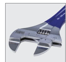
40% Slimmer Jaw