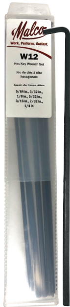
W12 7 Piece Set Big 12 in. Length

Available in 6 and 12 in. long series. Tough alloy steel with black oxide finish in clear storage tube.